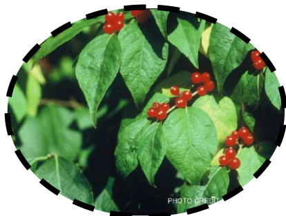
Glossy European buckthorn