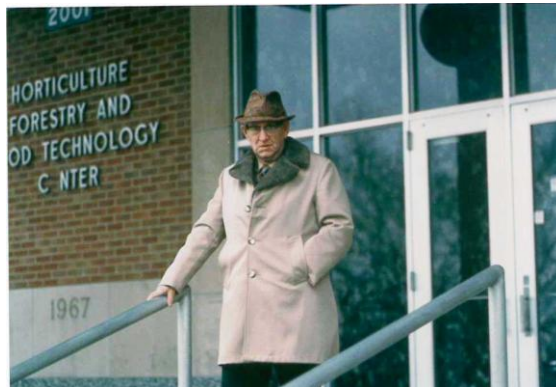
In front of Howlett Hall, OSU Campus, 1968-69